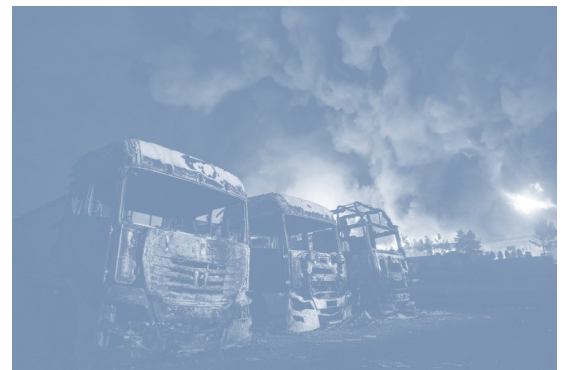
A fire breaks out at the Shahrn oil depot in Tehran.

- Archbishop Paul S. Coakley, President of the U.S. Conference of Catholic Bishops