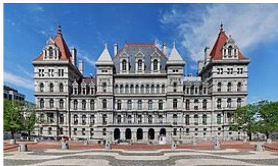
The New York State Capitol

The New York State legislature ended its regular session in early June. The bad news is, they did not pass the Bigger Better Bottle bill or the Packaging Reduction bill. Environmental advocacy organizations leading the efforts will continue to ask for our support in the coming session, or in a special session if the Governor calls one before the end of this year.