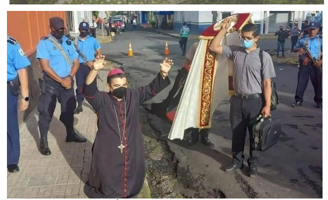
Bishop Rolando Álvarez of Matagalpa, Nicaragua, is monitored by police in early August 2022.

Religious Freedom Week Embracing the Divine Gift of Freedom